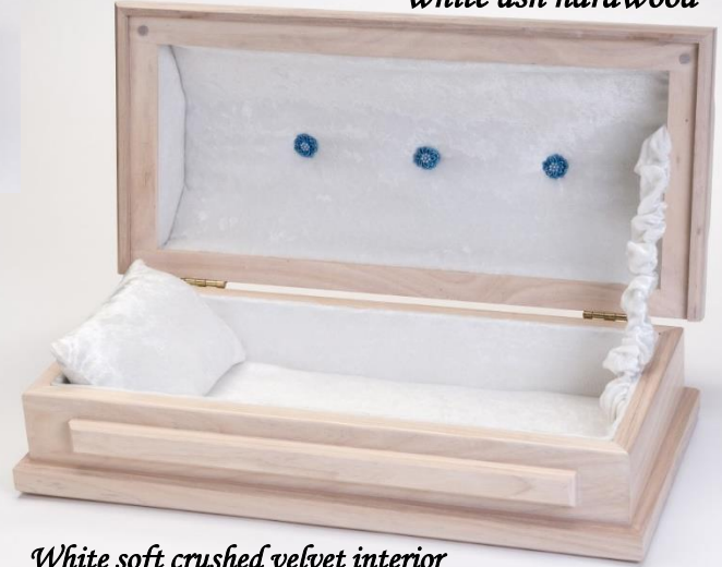
White soft crushed velvet interior

Lovely Crafted Interior: Each interior is designed and crafted by our Heaven's Gain team. Each interior is lined with a white crushed velvet fabric. The mattress and pillow are covered with the same beautiful, soft crushed velvet fabric.