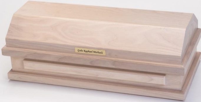
white ash hardwood

White Ash: Our precious white ash casket has a white wash stain that allows the wood grain pattern to show through. Our white ash caskets are made by Amish craftsmen of northern Ohio.