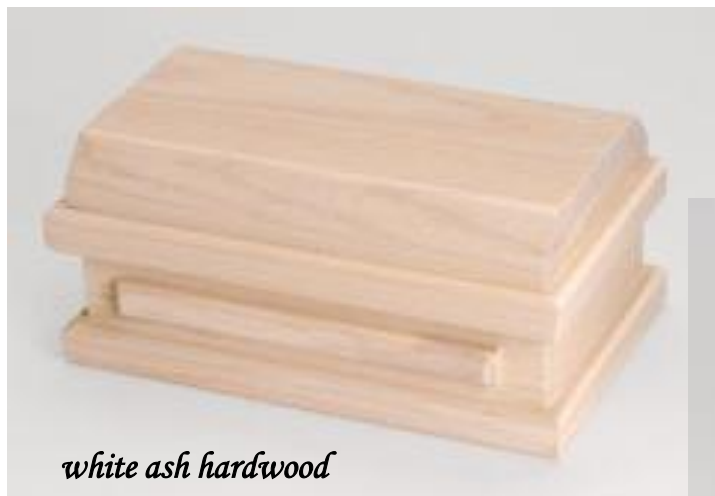
white ash hardwood

White Ash: Our white ash casket has a white wash stain that lets the wood grain show through. The interior of this casket is carefully crafted in a white soft crushed velvet. These lovely solid white ash caskets are made by Amish casket woodcrafters of northern Ohio.