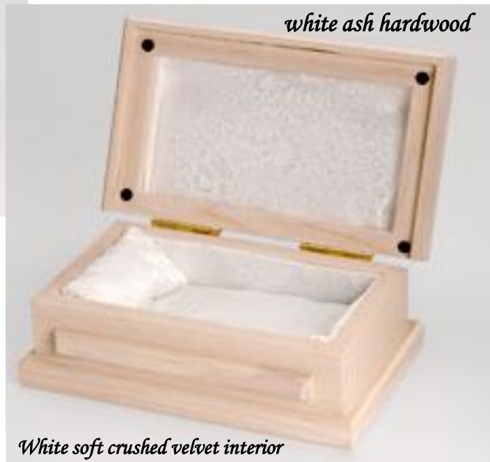
white ash hardwood

White Ash: Our white ash casket has a white wash stain that lets the wood grain show through. The interior of this casket is carefully crafted in a white soft crushed velvet. These lovely solid white ash caskets are made by Amish casket woodcrafters of northern Ohio.