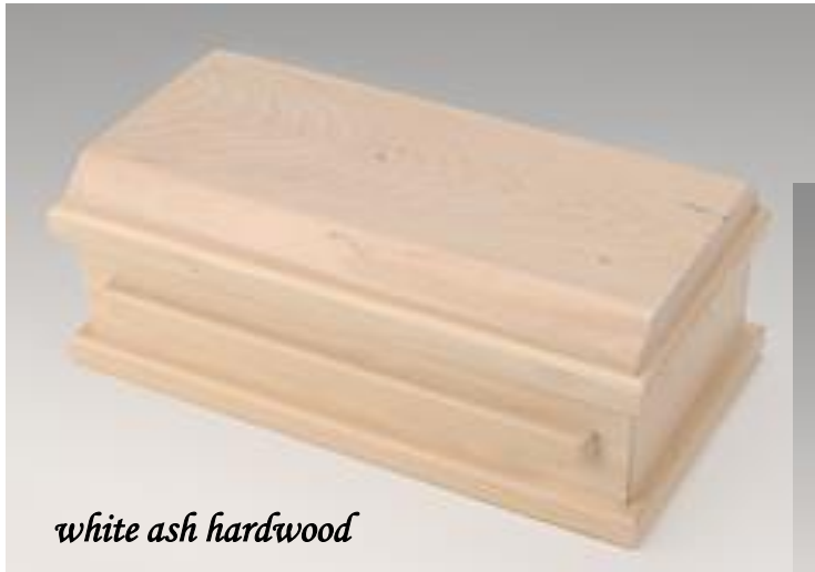
white ash hardwood

Lovely Crafted Interior The interior is designed and crafted by our Heaven's Gain team. Each interior is lined with a white crushed velvet fabric. The mattress and pillow are covered with the same beautiful soft fabric. Personalize your casket by choosing from optional accent bows in pink, blue, white, or purple.