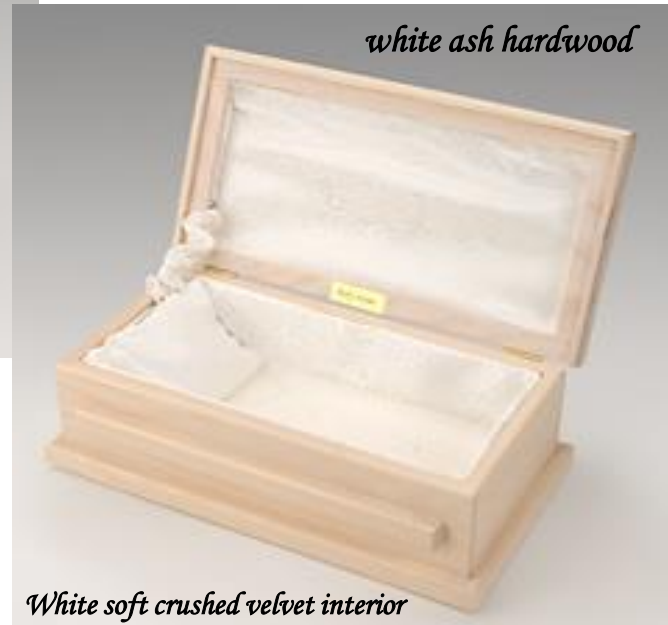
white ash hardwood

White Ash: Our precious white ash casket has a white wash stain that allows the wood grain pattern to show through. Our white ash caskets are made by Amish Craftsmen of northern Ohio.