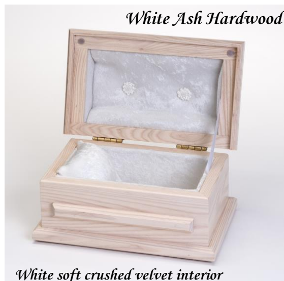
White Ash Hardwood

White Ash: Our white ash casket has a whitewash stain that lets the wood grain show through. The interior of this casket is carefully crafted in a white soft crushed velvet. These lovely solid white ash caskets are made by Amish casket woodcrafters of northern Ohio.