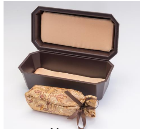
Golden Interior (Item # C-9-1G)

This casket/vault combo has the appropriate padding to snugly fit the vessel as an added protection. The diameter of the opening to the saline bath* vessel is 1.48 inches, and the length is 5 inches. Casket, saline bath* vessel, glue, and a matching flannel vessel cover are included.