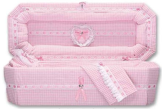
Style 8G - Pink Gingham