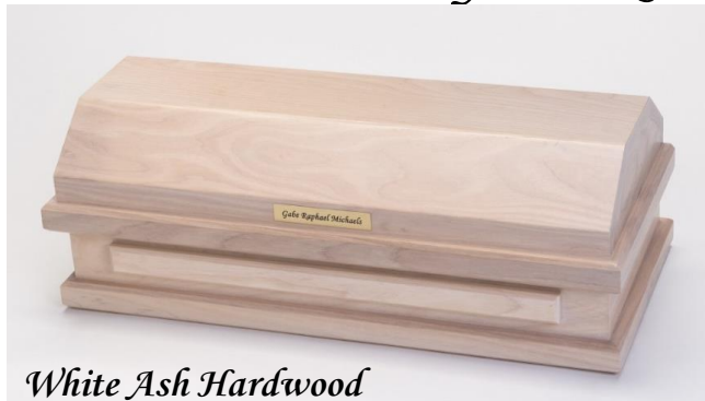
White Ash Hardwood

Exterior size: 23"L x 12.5"W x 8"H Interior size: 20"L x 10"W x 4.75"H