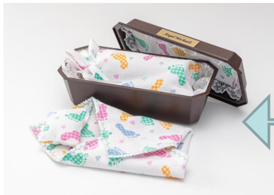
Vessel, Cover and Blanket Option

We recommend ordering this generic casket in bulk to keep on hand. We also recommend both the vessel and cover and the pillow and blanket. (Item # C-9-2B)