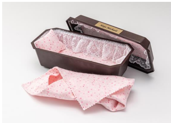
Blanket and Pillow option