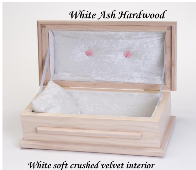
White Ash Hardwood

White Ash: Our precious white ash casket has a whitewash stain that allows the wood grain pattern to show through. Our white ash caskets are made by Amish craftsmen of northern Ohio.