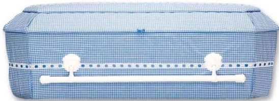
Style 8G - Blue Gingham