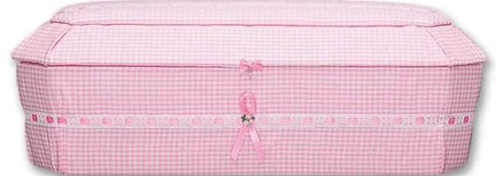
Style 8G - Pink Gingham