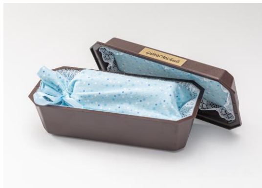
Vessel and Cover Option