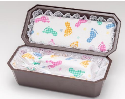
Baby Print Flannel Interior (Item # C-9-1B)

This casket/vault combo has the appropriate padding to snugly fit the vessel as an added protection. The diameter of the opening to the saline bath* vessel is 1.48 inches, and the length is 5 inches. Casket, saline bath* vessel, glue, and a matching flannel vessel cover are included.