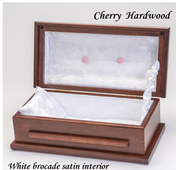
White brocade satin interior

Cherry: Our custom solid cherry hardwood caskets have a deep, rich stain and are so elegant. These caskets are handcrafted by the Amish of northern Ohio.