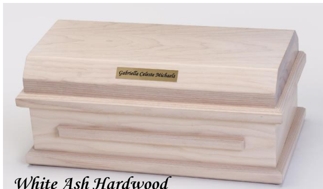
White Ash Hardwood

Lovely Crafted Interior The interior is designed and crafted by our Heaven's Gain team. Each interior is lined with a white crushed velvet fabric. The mattress and pillow are covered with the same beautiful soft fabric. Personalize your casket by choosing from optional accent bows in pink, blue, or purple.