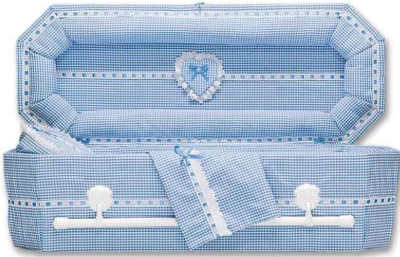
Style 8G - Blue Gingham