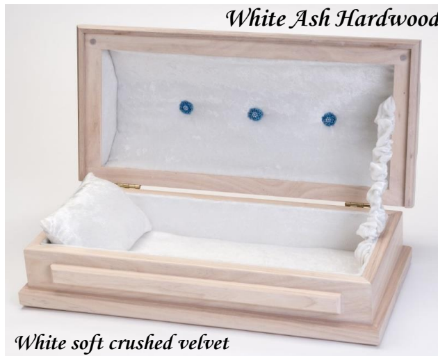
White Ash Hardwood

White Ash: Our precious white ash casket has a whitewash stain that allows the wood grain pattern to show through. Our white ash caskets are made by Amish craftsmen of northern Ohio.