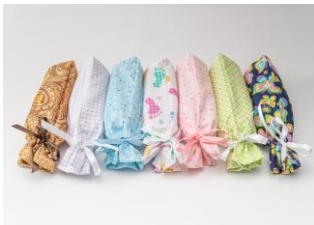
Cremated Remains Vessel Cover Choices for cherry wood urns