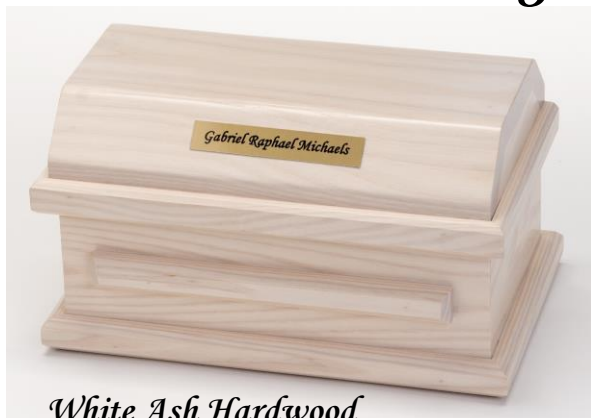
White Ash Hardwood

Exterior size 11.5"L x 6.5"W x 6"H Interior size 9"L x 5"W x 3.5"H